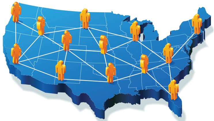
Our nationwide network of trained inspectors quickly returns high-quality reports, no matter the volume.

We have a nationwide network of inspectors ready to execute your order quickly and precisely. Developed over many years, this network includes multiple people in most jurisdictions to help efficiently process orders as volume increases. With OnSite, you can rest assured that your order will be addressed quickly.